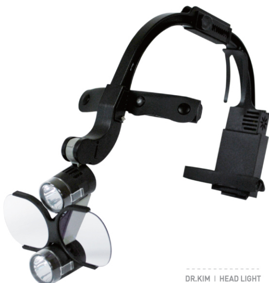
DR.KIM | HEAD LIGHT DKH-50